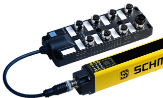
Muting sensor connection unit