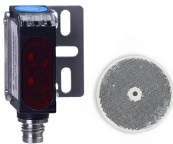
Reflective muting sensor