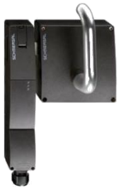
AZM200 with door handle

We offer a wide range of safety locks, door handle assemblies, and safety sensors, with special mounting brackets which can be integrated into the guards for a complete safety solution.