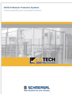
SATECH Guarding Systems Catalog, 36 pages