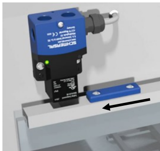
Sliding guard, approach from side