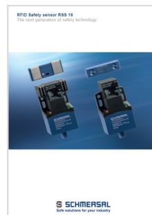
RSS16 Brochure 4 pages