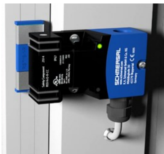
Magnetic latching option