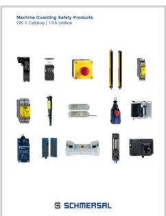
GK-1 Safety Products Catalog 120 pages