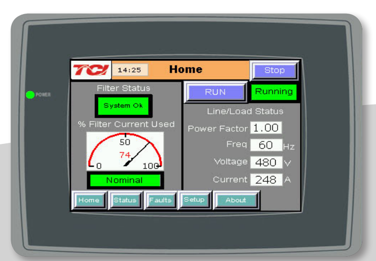
Large, 65K Color HMI

A large, built-in, 65k color touchscreen HMI display with LED backlight is included, along with the communication options of Modbus RTU over RS485, Modbus TCP/IP, EtherNet/IP, DeviceNet and HGA-HMI.