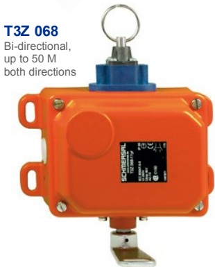
T3Z 068 Bi-directional, up to 50 M both directions