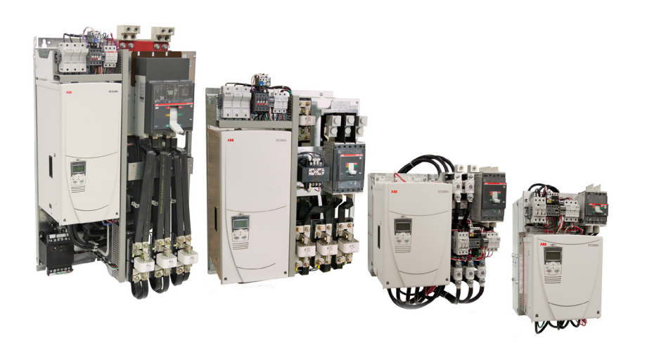
ABB DC drives DCS800-EP1/EP2, 10 to 600 Hp

The DCS800 Panel Drive is a preengineered solution for quick and easy design and installation. All required peripheral components are included on a space-efficient back panel, ready to be mounted into an industrial enclosure The drive is an excellent replacement for the Reliance Electric® FlexPak 3000®.