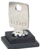
SWS20 Keypad Selector Switch with maintained actuation for position 2