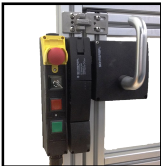
BDF200 fits standard housing extrusions and aesthetically matches our AZM200.